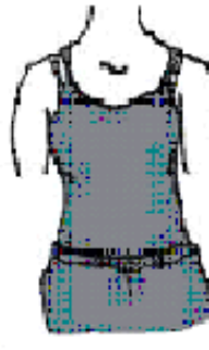
Visible Undergarmets "Spaghetti Straps"

Please be advised that the following dress code will be enforced.