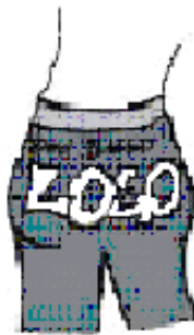
Poorly Placed Logo